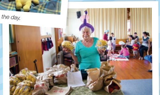
Everyone gets involved at the St Luke's South New Brighton Fun Day.