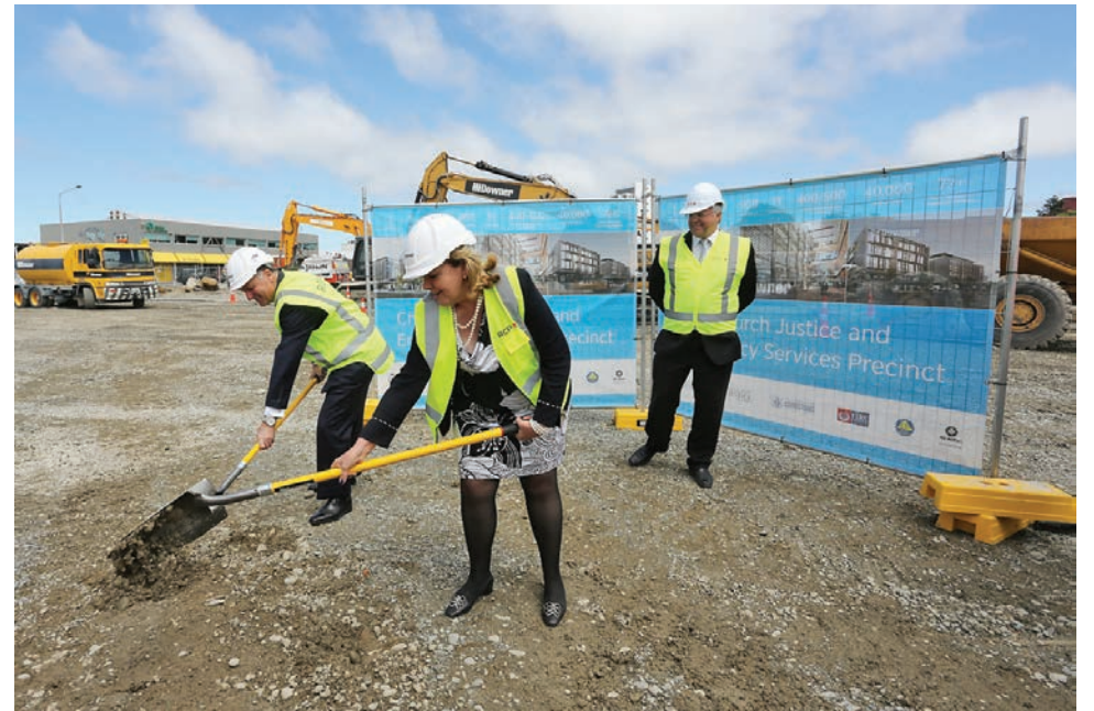
Getting amongst it: Prime Minister John Key and Minister of Justice Judith Collins turn the first sod on the Justice and Emergency Services Precinct.