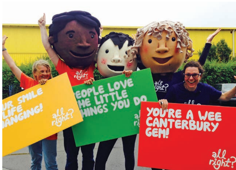
Big headed All Righties have helped share the love this summer at Outrageous Bursts and at the SCIRT World Buskers Festival .

"We've also featured in the Huffington Post and have had preliminary discussions with the Australian Red Cross about