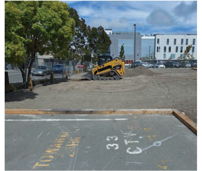
Work in progress at the CTV site. Improvements include the grassing of some of the site, removing the high fencing and replacing it with a low post and chain fence, placing planter boxes on the perimeter and installing a sign that recognises the site's significance. Terranota has donated the timber for the planters.

An Earthquake Memorial for all affected by the earthquakes is being planned quite separately from the work at the CTV site. 🌱