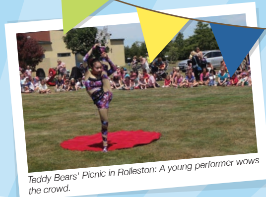
Teddy Bears' Picnic in Rolleston: A young performer wows the crowd.

The Summer of Fun programme runs until the end of March 2014, with events in Christchurch and the Waimakariri and Selwyn districts. To find out more about specific events in your neighbourhood, go to: www.bethere.co.nz or check out the Choice Chch Facebook page. ♻️