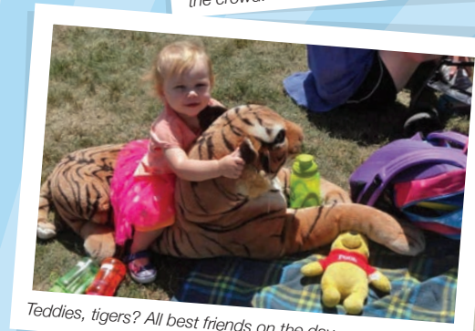
Teddies, tigers? All best friends on the day.