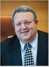
Hon Gerry Brownlee Minister for Canterbury Earthquake Recovery

2014 marks a turning point in Canterbury's recovery story. As I mentioned in the last Update, international experience suggests the third year after a disaster is often the toughest: but having gotten through that, things can often move forward with renewed energy.