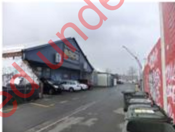
Existing view east along Market Street with existing building ready for re-purposing