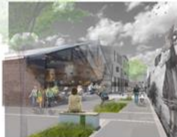
Perspective illustration view of a renovated building with glass area overlooking the 'Greenway'