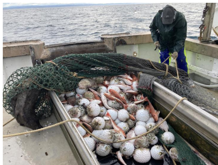
Hawke's Bay bottom trawlers are continuing to have challenges with their fishing operations. This image shows a large log entangled in the net.

As at 7 July, 5,630 applications for farmer and grower recovery grants have been approved and paid, totalling $64.25 million in value.