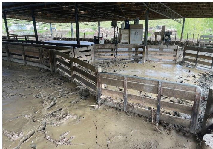
Silt through a woolshed at Waimata.