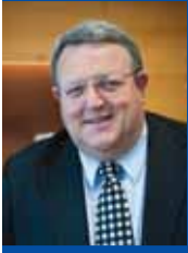
Gerry Brownlee Canterbury Earthquake Recovery Minister

As I write, I am looking forward to the first Crusaders home game in Christchurch since the damage to AMI Stadium sent the franchise on a permanent road trip. I'm sure many of you are too.