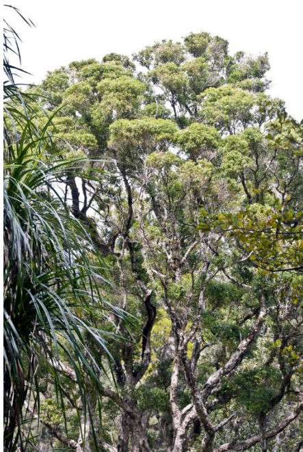
Figure 3 Rātā moehau/Bartlett's rātā is a critically endangered species endemic to Northland with only 13 known adult trees in the wild.

The fungus can reproduce quickly (between two and four weeks) in conditions of high humidity and temperatures around 25°C. After infection, it will take up to two weeks for the disease symptoms to present, which makes it hard to identify in the early stages. Most fungi reproduce asexually, but myrtle rust can reproduce sexually. Sexual reproduction introduces more genetic variability, meaning myrtle rust may adapt more rapidly—with the potential it might infect new host plants as a result. [6] If the South African strain arrived in Aotearoa New Zealand, in addition to the damage it would cause, there is also concern that the two strains could sexually reproduce to potentially form more aggressive new strains. [2] Myrtle rust is mostly transmitted by wind, but spores can also be spread via contaminated clothing, insects and equipment. [7]