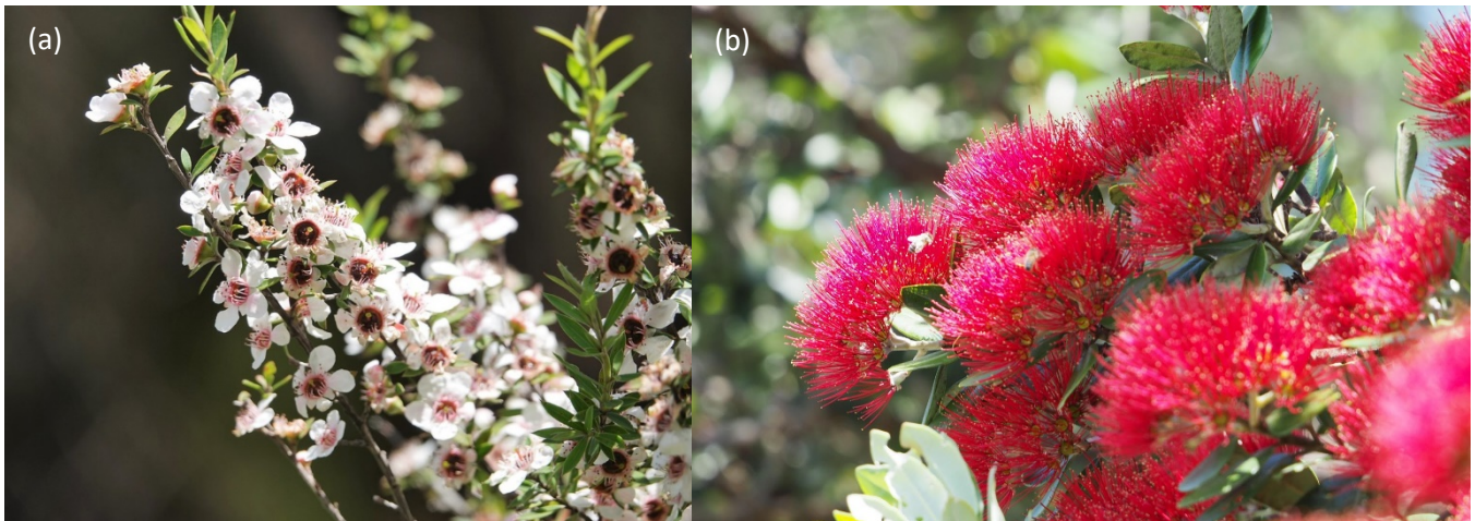
Figure 2 Two iconic native species threatened by myrtle rust in Aotearoa New Zealand: (a) Mānuka ( Leptospermum scoparium ) by jacqui-nz (CC-BY-NC-SA 4.0) via iNaturalist ; (b) Pōhutukawa ( Metrosideros excelsa ) by E. Rykers.

Rusts are fungal diseases that typically affect just one species of plant. Myrtle rust is unusual compared to other rusts as it affects hundreds of species globally [3] and is expected to impact 37 native taxa, including species of pōhutukawa , mānuka , kānuka and rātā . [4] It can attack the new growth, flowers and fruits of infected plants. Repeated infections reduce the plant's ability to regenerate and mature. [5]