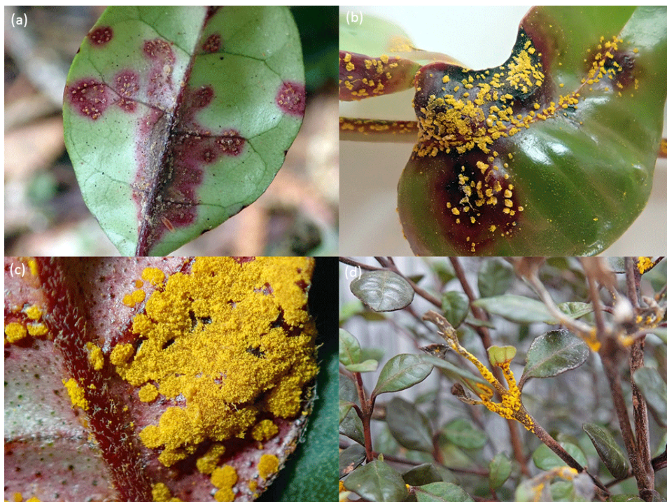
Figure 1 Various stages of myrtle rust infection on myrtle plants in New Zealand. Images (a), (b) and (c) by Peter de Lange/pjd1 via iNaturalist (CC0) and image (d) by jacqui-nz via iNaturalist (CC BY-NC 4.0).

Myrtle rust is a disease that arises from the fungus Austropuccinia psidii , which has several different strains.[1] The 'pandemic' strain is present in Aotearoa New Zealand. Rust fungi typically form raised spots on the underside of leaves which become red-orange spore masses after some time, before turning grey or black. This causes leaves to deform and drop off the plant.